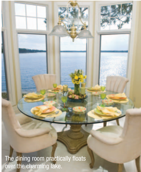
The dining room practically floats over the charming lake.